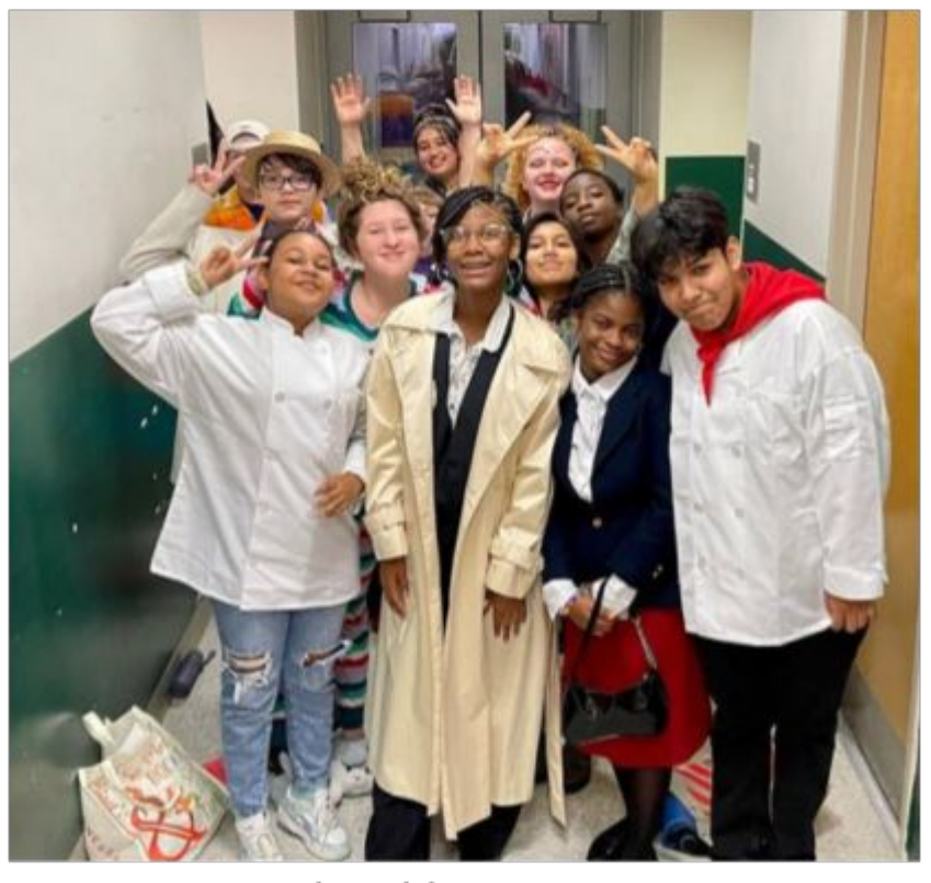
The Alibis Crew