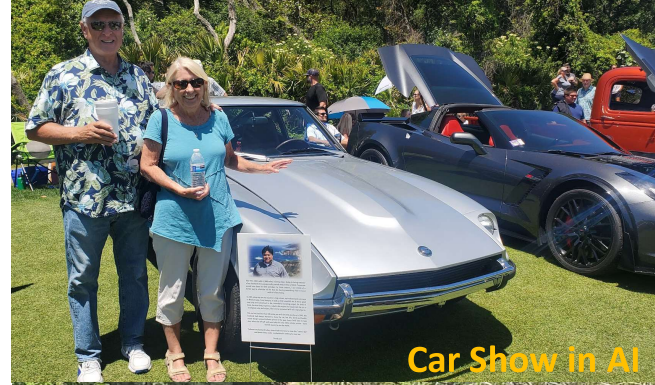
Car Show in AI

We are hoping you are all well and are managing to make a good life for yourselves in our new normal world. We wish you all the best for the holidays and for next year.