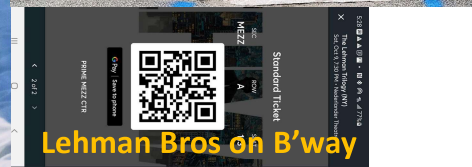
Lehman Bros on B'way