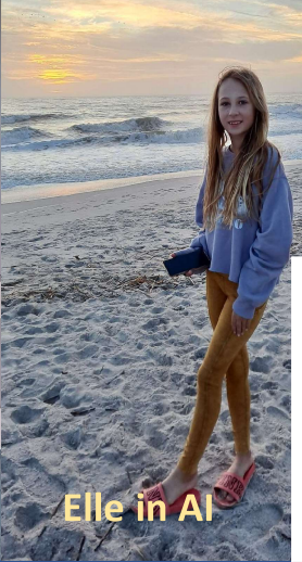
Elle in AI