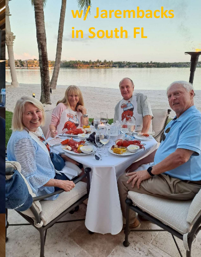
w/ Jarembacks in South FL