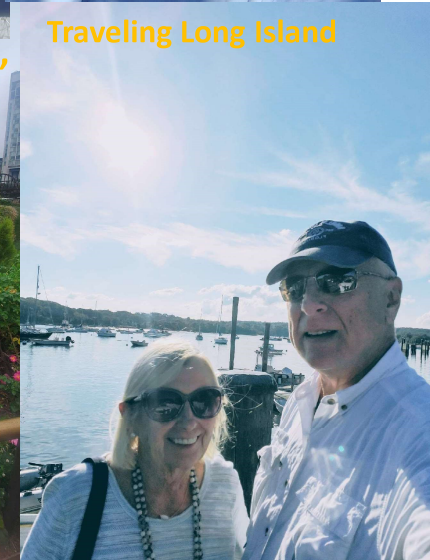
Traveling Long Island