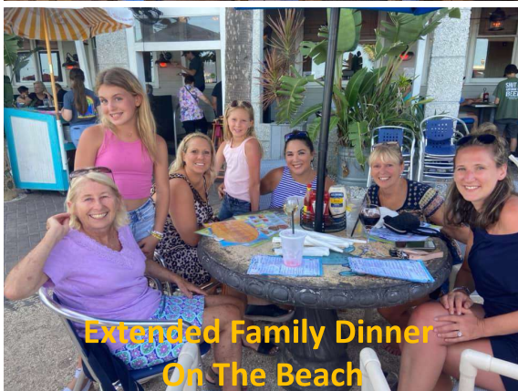
Extended Family Dinner On The Beach