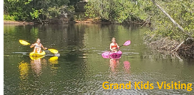
Grand Kids Visiting