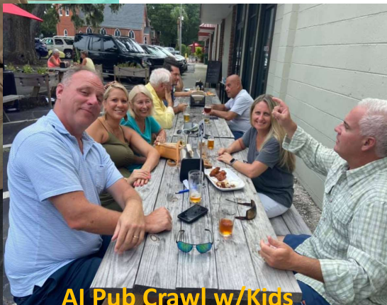
AI Pub Crawl w/Kids