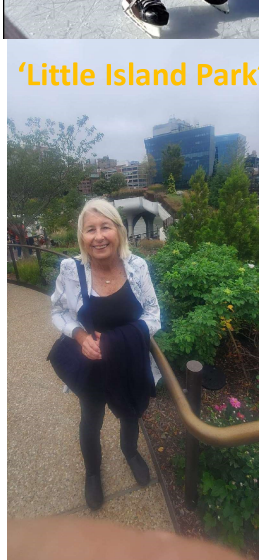
'Little Island Park'