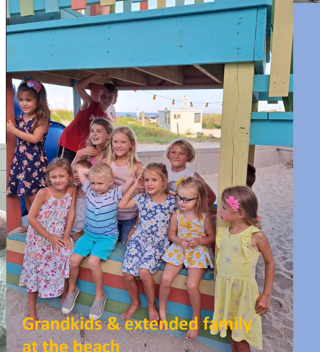
Grandkids & extended family at the beach