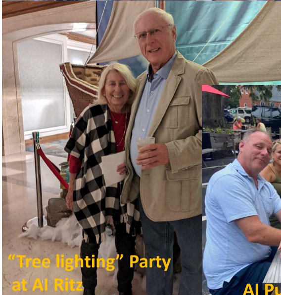
"Tree lighting" Party at AI Ritz