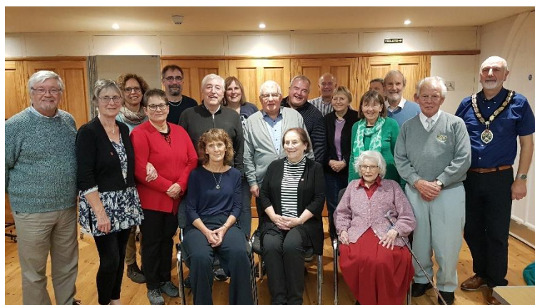
The committee, Mayor and guests at the Friday Supper

We would like to thank all those who helped to make this such a successful weekend