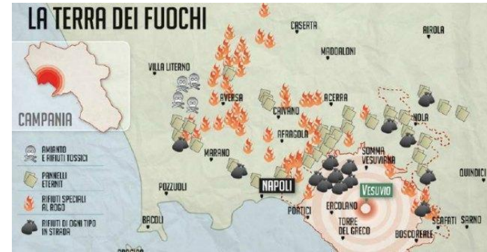
Figure 2. Caporale, Antonello. “Napoli, la terra dei fuochi: aria infetta, rifiuti e tumori attorno al Vesuvio”. Il fatto quotidiano , 9 november 2013.