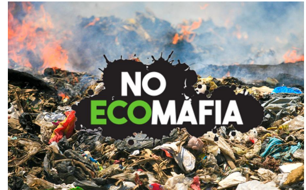
Figure 1. “La criminalità dei rifiuti”. Redazione Web, 24 december 2019.