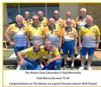
The Waves Club Caloundra V Club Maroochy Club Maroochy won 71-47 Congratulations to The Waves on a great Pennant Season Well Played