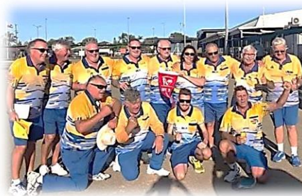
Men's Pennant Finals 2021 Division 2