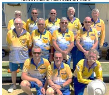
The Waves Club Caloundra V Club Kawana Won by Club Kawana 52-49 Congratulations to The Waves so close