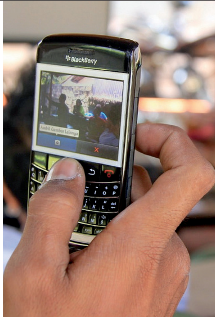
Giving readers something to see as well as read helps build an audience.

In terms of design, most services have basic templates to get you started, and there are thousands of themes