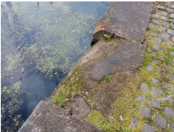
Image 8 ~ Damaged Stone on Slipway quay (used by electric dinghies & kayak clubs)

The tow path verge is extremely damaged, Especially in the area of the water point used by the holiday fleet. The collapsed verge becomes slippery in wet weather and from running water when boats are filling up from the tap.