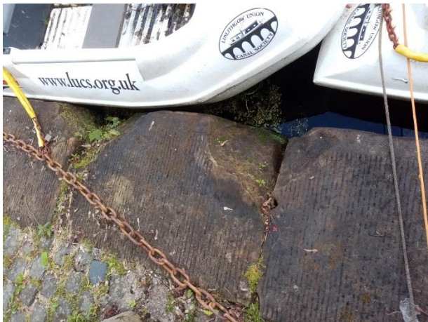
Image 9 ~ Damaged Stone on Slipway quay (used by electric dinghies & kayak clubs)