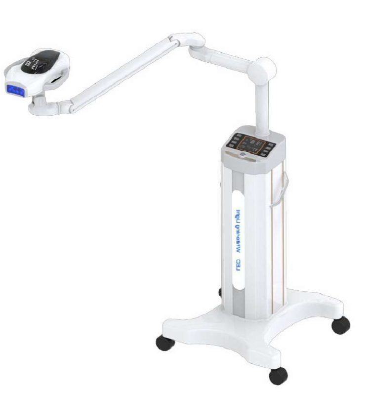
Fig 1. The Ultima 10k