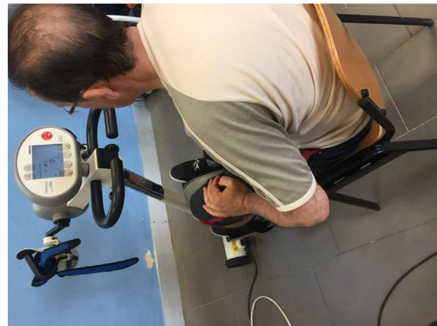
Figure 1 MOTomed Viva2 Movement Trainer ® system.

The research protocol was reviewed and approved by our hospital's research ethics committee (C.P.-C.I. 1896). All participants gave written informed consent to be included in the study.