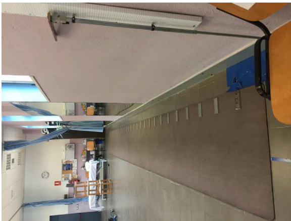
Figure 2 GAITrite® Electronic Walkway system.