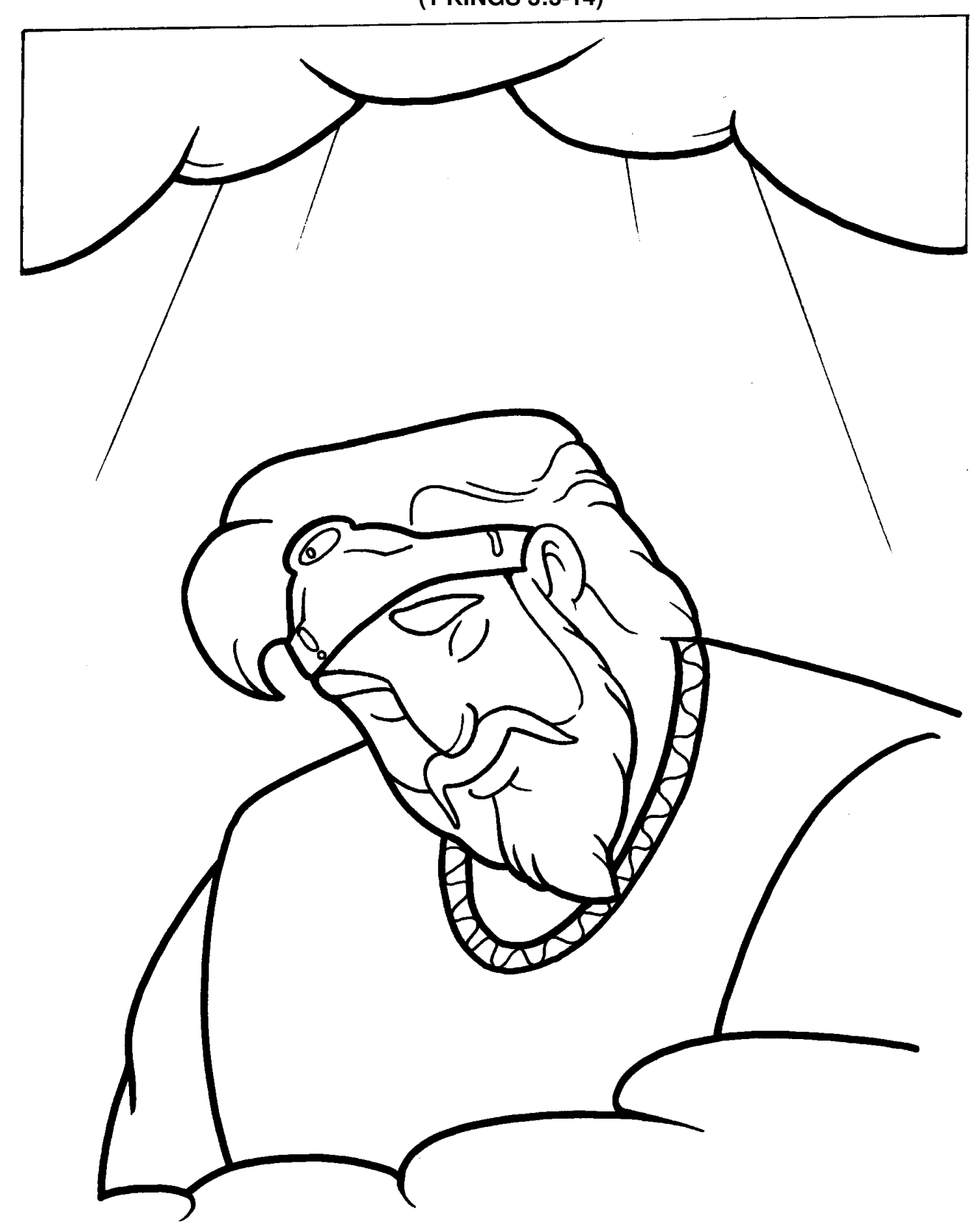
In Gibeon, Solomon had a vision of the Lord in a dream at night; and God said to him, Say what I am to give you. 1 KINGS 3:5

Give your servant, then, a wise heart for judging your people, able to see what is good and what evil; for who is able to be the judge of this great people? 1 KINGS 3:9