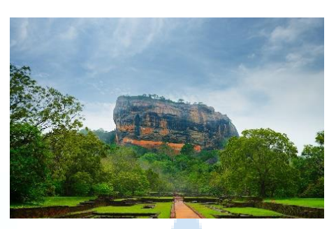
Day 1 & 2: Upon arrival we are heading to Sigiriya. In between Sigiriya our 1st stop is Pinnawala Elephant Orphanage. Then we Visit Sigiriya, Dambulla, Anuradhapura and Polonnaruwa if the time permits.

Accommodation: Jetwing Lake-Sigiriya 5* or Akira 5* or Similar