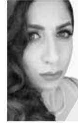
Reina Bou Farraa Sami Jade

Conclusion. No significant difference between the two treatments, Nd:YAG laser and MI Varnish. Both were effective and reduced dentin hypersensitivity immediately after treatment up to 6 months.