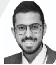
Julien Issa Nayer Aboelsaad

Materials and methods. A total of 40 primary root canals from 10 second primary mandibular molars presenting symptomatic irreversible pulpitis and requiring pulpectomy were selected. The sample population age was between 4 and 8 years old and was divided into two groups: Group I consisted of 20 root canals that were instrumented with Hedström files and Group II of 20 root canals that were instrumented with XP-endo Shaper single rotary file. For each canal, instrumentation time and quality of obturation were assessed. Statistical analysis was done using Chisquare and ANOVA tests.