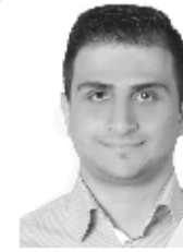
Omar Zein Mohammad Badra Youssef Khatib Mohamed Shokry

Conclusion. Modified palatal roll flap is a minimally invasive connective tissue pedicle graft method that stabilizes reconstructed tissue volume around healing abutments and minimizes pink prosthetic camouflage.