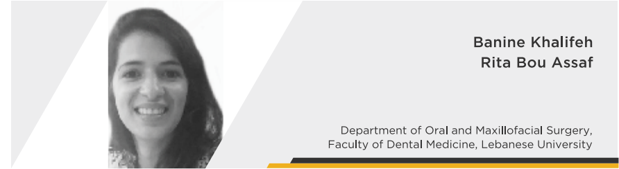
Banine Khalifeh Rita Bou Assaf

Conclusion. Aesthetic crown lengthening alone resulted in a clinical important decrease in gingival exposure. Moreover, the increase in the crown's height led to a more triangular tooth shape with better scalloped papillas. Nonetheless, clinical and radiographical examination are crucial to ensure a proper diagnosis and an adequate management of each case.