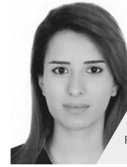
Nancy Abdo 1 Anthony Macari 1 Lara Nasreddine 2 Joseph Ghafari 1

Results. Vertical bone resorption was on average 0.7 mm for the direct and 0.1 mm for the indirect restorations ( p < 0.05 ). In vitro measures for color stability (E= Indirect: 1st interval=4.5, 2nd interval= 6.6, 3rd interval= 8.3, Direct 1st interval=6, 2nd interval=8, 3rd interval= 13), surface roughness (Direct Ra =0.067Q, Indirect Ra = 0.250 Q), marginal gape with Cement Replica: Direct=146Q, Indirect =152Q NanoCT marginal gape: Direct=135Q, Indirect =125Q) with all significant between both groups ( P < 0.05 ).