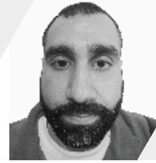
Samer Salameh Charbel Choubaya

Conclusion. The evaluation of mandibular third molar development on panoramic radiographs only could be sufficient and potentially used as growth predictor in different skeletal patterns, preventing the need for any additional radiological exposure.