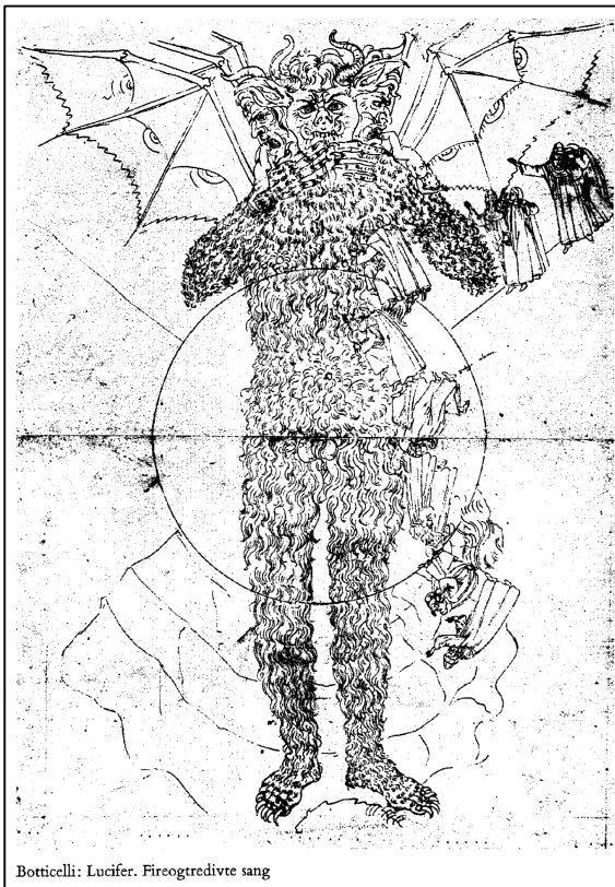
Figure 2: Lucifer at the centre of Earth in a drawing by Sandro Botticelli about 1500 – Vergil with Dante on his back is crawling down and turns upside down, when he reaches the centre.

But we shall be mostly concerned with the belief of mankind over times about the size of the universe with respect to distances to the Moon, Sun, planets, and stars. The recent 100 years with galaxies and the Big Bang shall however be mentioned at last.