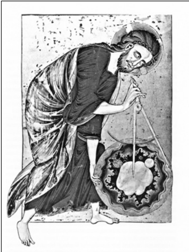
Figure 3: God as the architect, illustration from a Middle Age bible – God has created the universe after geometric and harmonic principles. To seek these principles was therefore to seek and worship God, meant for instance Kepler.

We must not forget the contribution from the Middle Ages. Christian thinkers were much concerned with the concepts of time, eternity, and space because the Christian God is eternal and omnipresent. They created a philosophical language in which they could speak about these matters in a way that made sense. During Antiquity and Middle Ages the Christian teachers (missionaries and priests) fought astrology and old superstition, which however still have a firm grip in many people of our time. But superstition is quite alien to the Christian belief in an ordered world, a world and a universe ordered in harmony by the eternal God, a God who does not interfere in everyday matters. God as architect of the universe appears, for instance on a illustration in a bible from the Middle Ages. A belief in miracles hardly complies with this concept of God.